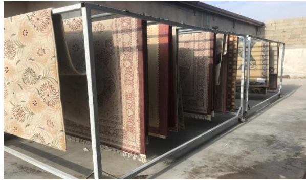
Fotoğraf 18. Yıkanan halıların kurutma tezgâhlarına asılması (Kılıç Karatay 2023)