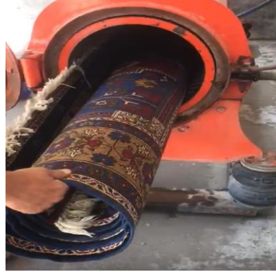
Fotoğraf 16. Halının sıkma makinesine yerleştirilmesi (Kılıç Karatay 2023)