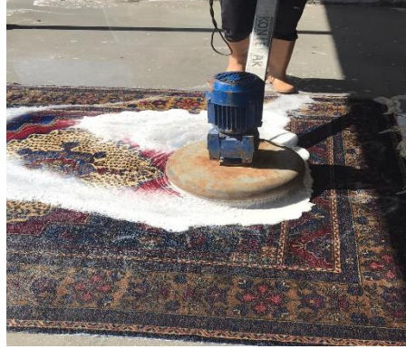
Fotoğraf 14. Halının sırt kısmından yıkanması işlemi (Kılıç Karatay 2023)