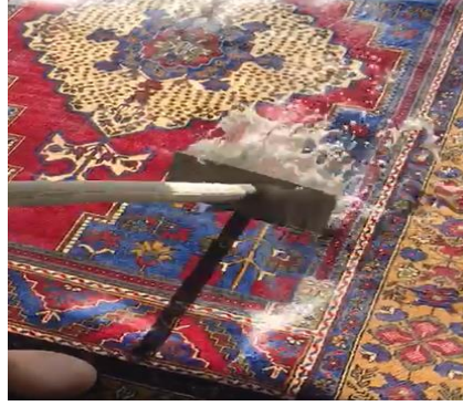
Fotoğraf 15. Halıdan gelbere ile suyun ayrıştırılması (Kılıç Karatay 2023)